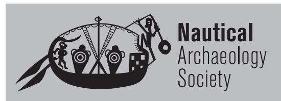
Logo on dark or graduated background