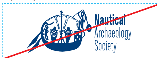
Logo being distorted

If in doubt about whether you can use the NAS logo over a specific image, please contact us for our approval or visit http://www.nasportsmouth.org.uk/about/logo.php for further guidance.